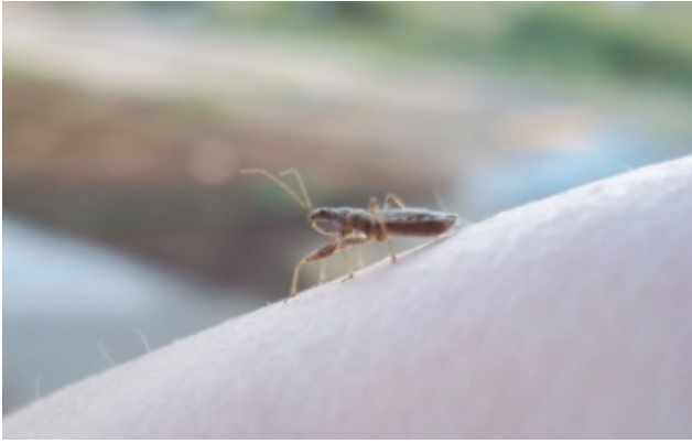
Figure 1: Nabis argentinus on bare skin.

Figura 1: Nabis argentinus sobre piel desnuda.